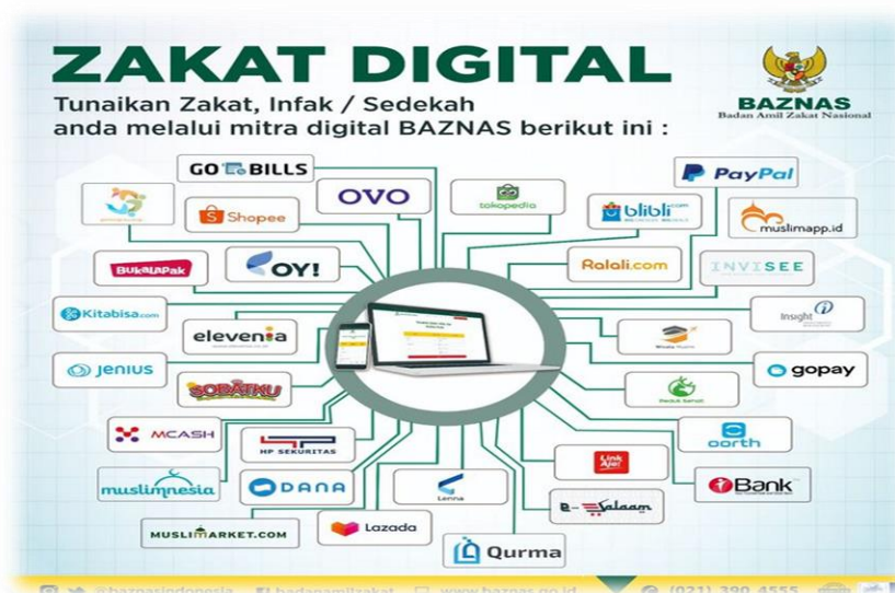
Figure 2. Digital Zakat Payment Application

The National Zakat Agency (Baznas) has also developed a technology system that enables optimal management and distribution of zakat. Digital processes boosted zakat collection sharply. Until 2019, it is predicted that zakat management will increase by 30%.